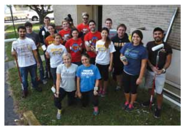
Celebrating the American Marketing Association's Marketing Week in October, Rowan's student chapter partnered with with Cumberland County Habitat for Humanity and the Boys and Girls Club of Vineland, pitching in to renovate a new building donated to the Boys and Girls Club.

Bunce Hall 201 Mullica Hill Road Glassboro, NJ 08028