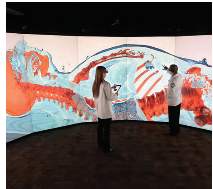
Healthcare education was just one of the applications students proposed for Rowan's Virtual Reality Center.